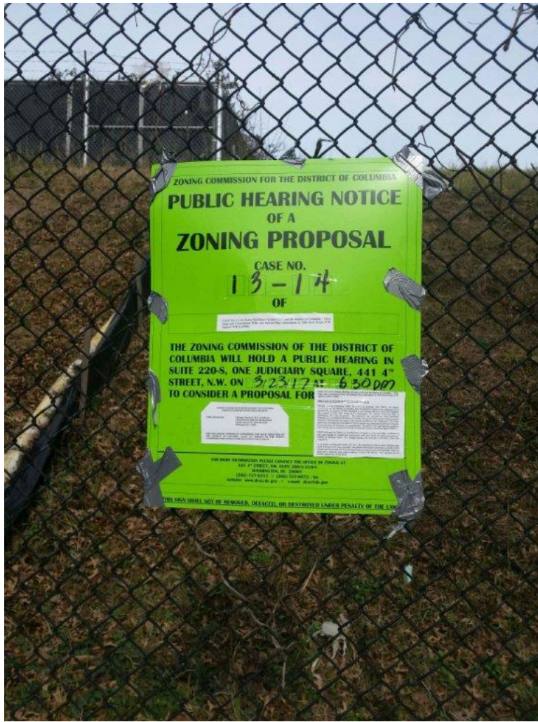
2. ZC 13-14 Posted 2-7-17 Channing Street NW