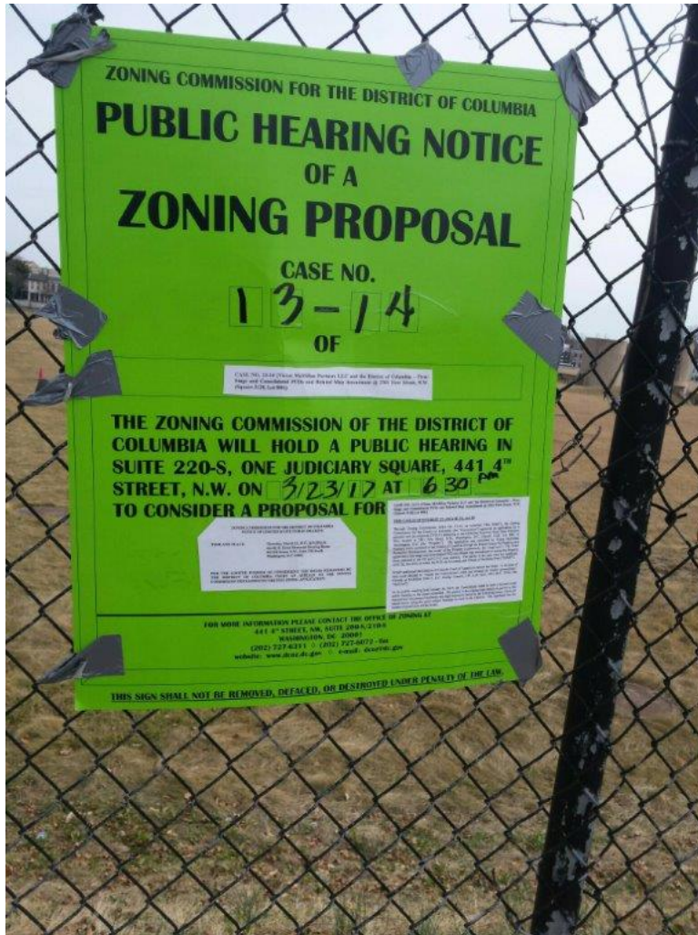
1. ZC 13-14 Posted 2-7-17 Channing Street NW